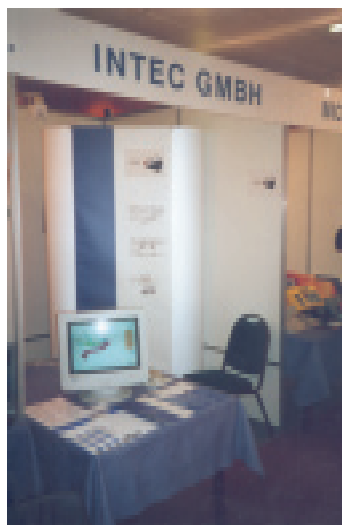
XXXII. Meeting of Bus and Coach Experts, Budapest